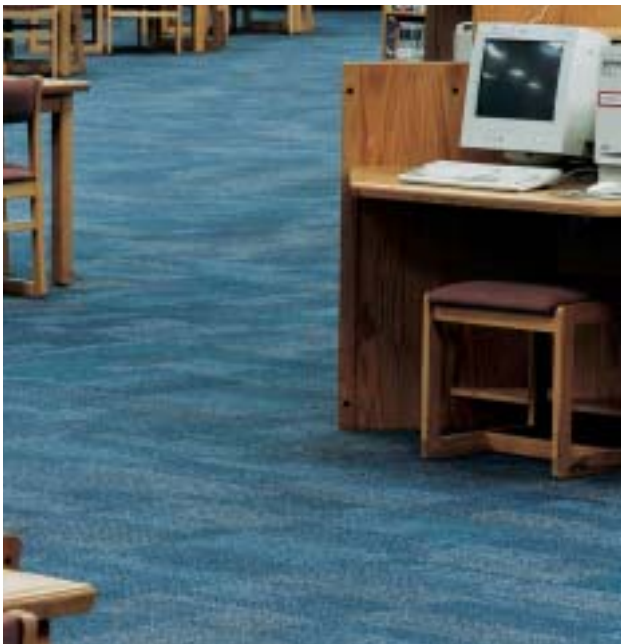
Cubic's soft surface provides superior sound absorption for a quieter atmosphere in this library.