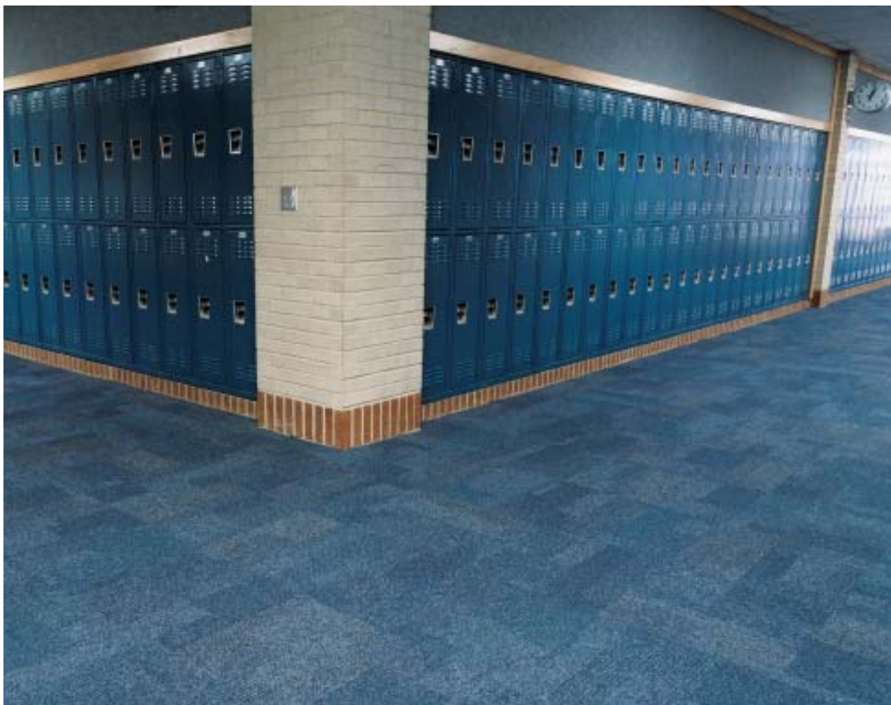
After one year of heavy traffic from students and staff, the Cubic carpet in this main corridor still looks new.